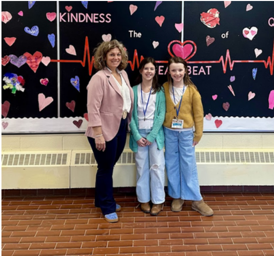
Principals for the Day