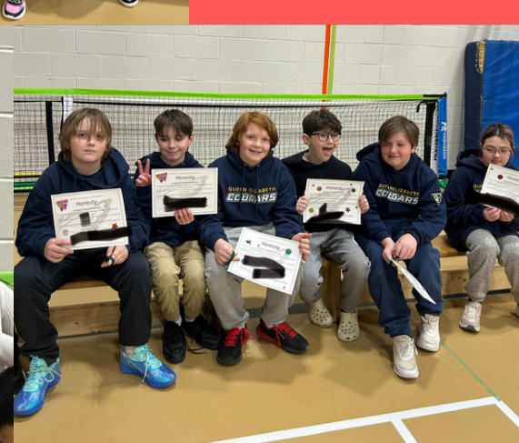
7 Sacred Teachings Assembly